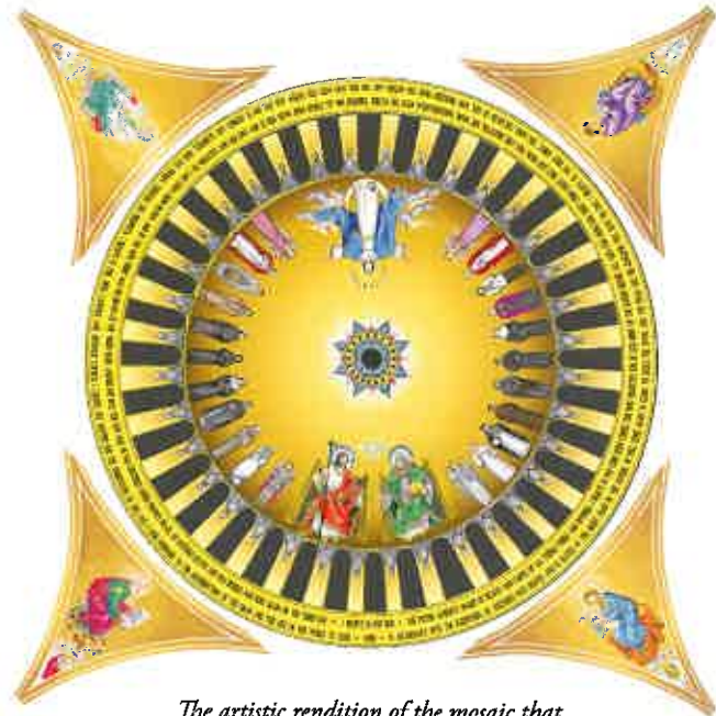
The artistic rendition of the mosaic that will adorn the Trinity Dome.

The Trinity Dome is the central and largest dome of the Basilica. This "Crowning Jewel" will be adorned in mosaic and will depict the Most Holy Trinity, the Blessed Virgin Mary as the Immaculate Conception, and a procession of saints who have an association with America and the Basilica. The Nicene Creed will encircle the base of the dome, while the dome's pendentives will feature the four evangelists: Matthew, Mark, Luke and John. The Trinity Dome will complete the work of the Great Upper Church according to its original iconographic scheme and bring to a close construction of the Basilica of the National Shrine of the Immaculate Conception as it approaches its centennial milestone in 2020.